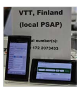
Research: IVS and PSAP on a Mobile Phone