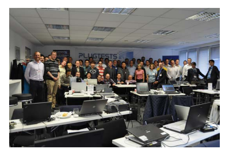
Group picture in test room